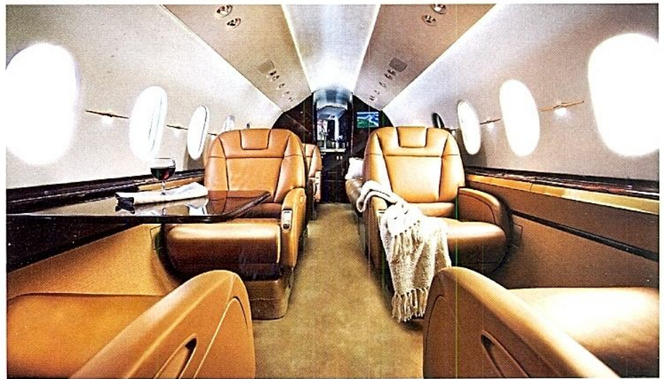
Top: Hawker 4000 boarding Above: Elegant interiors and settings

The business jet is well-furnished with modern amenities for short trips or long journeys. As the most important feature, the luxury jet offers generous space for relaxing and meetings. Contemporary settings make this cabin stylish and roomy enough for eight to ten people.