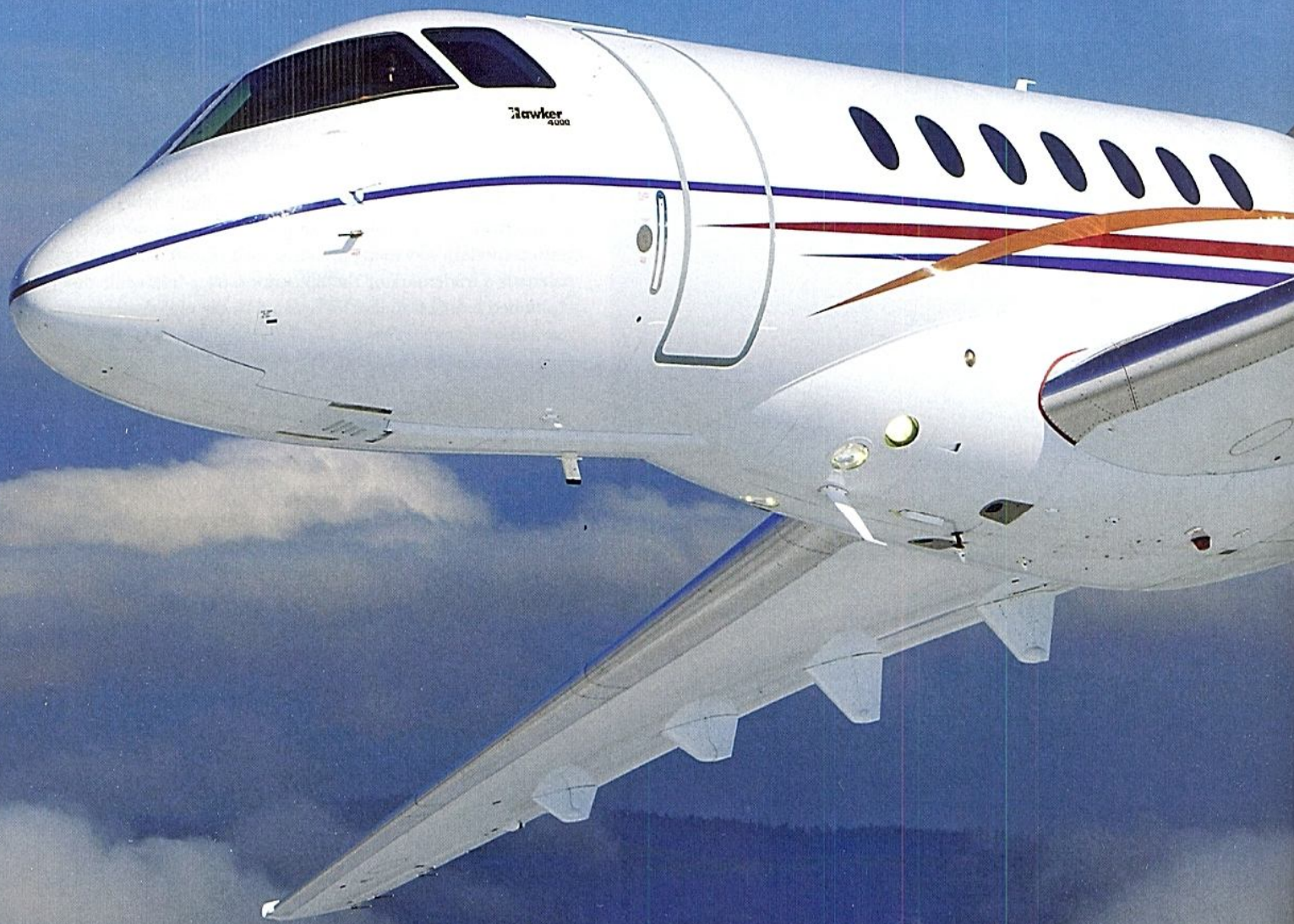
Hawker 4000 in flight